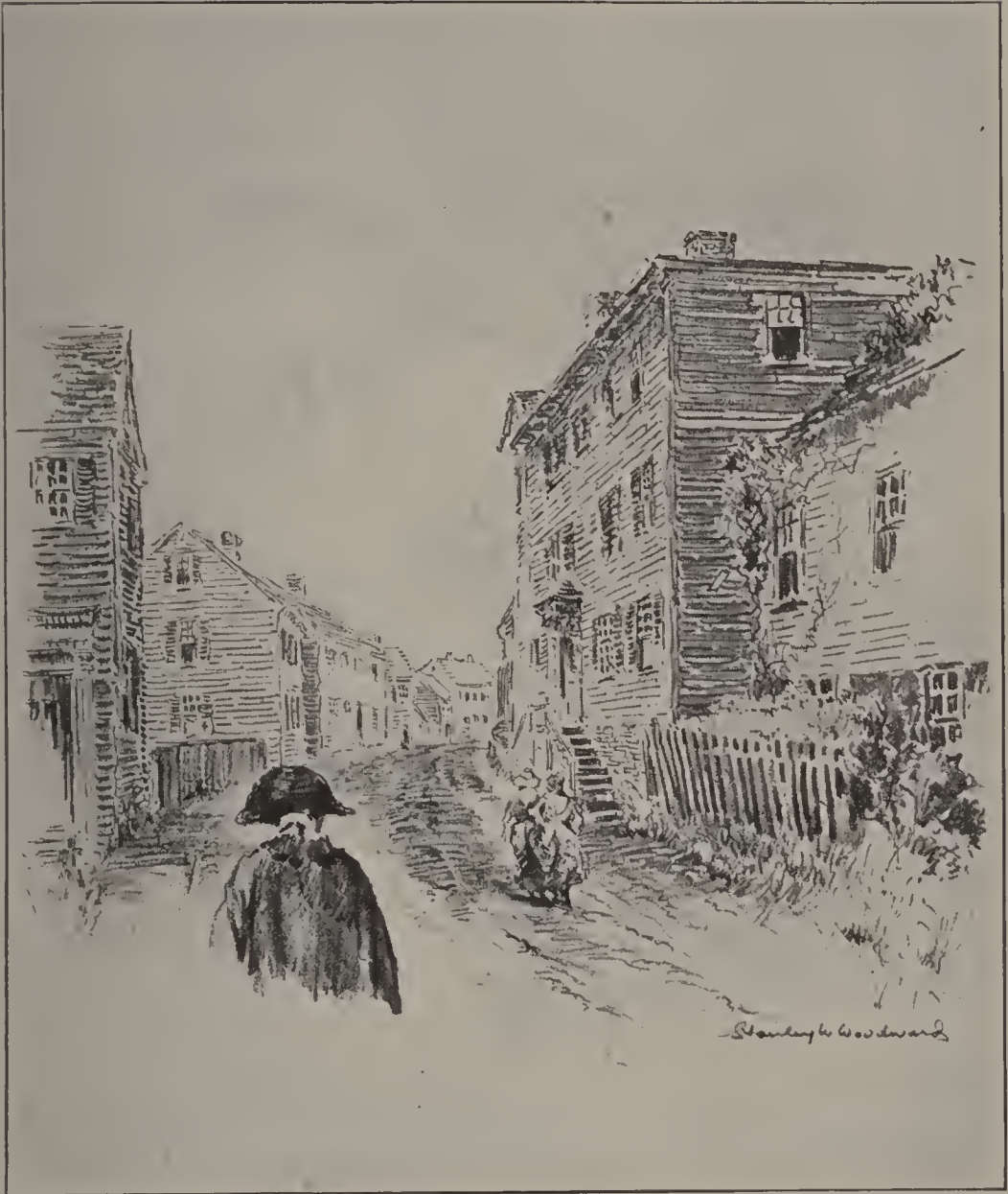
FRONT ST., MARBLEHEAD